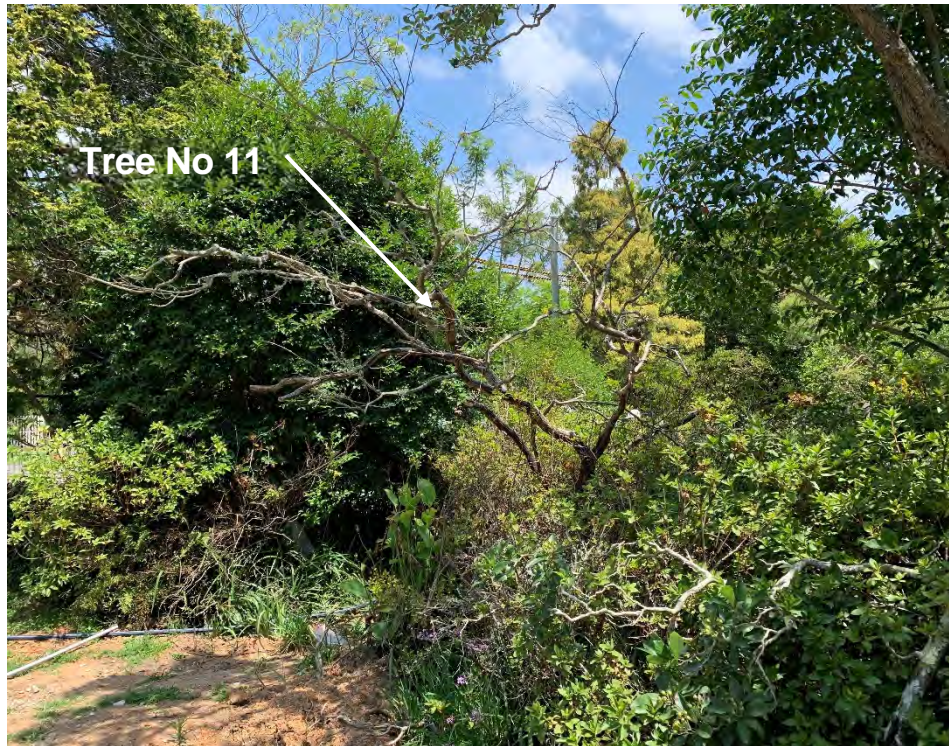
Figure 1 - Dead Tree No. 11 as of January 2023