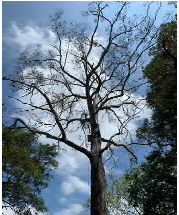
Figure 4 - The Trunk and Very Sparse Canopy of Tree No. 124 in a State of Terminal Decline as of January 2023