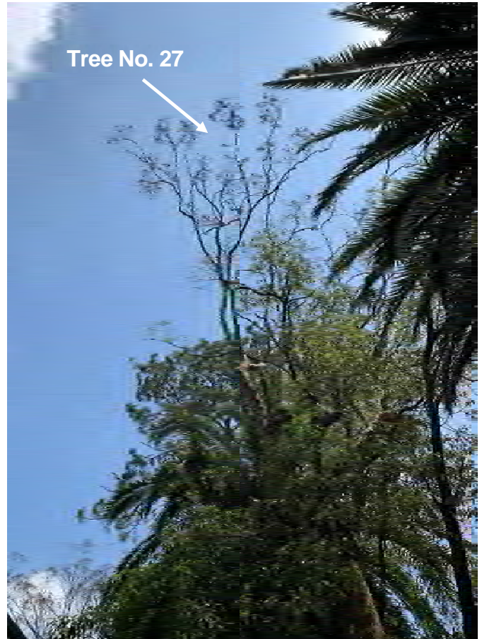
Figure 3 - The Trunk and Very Sparse Canopy of Tree No. 27 in a State of Terminal Decline as of January 2023