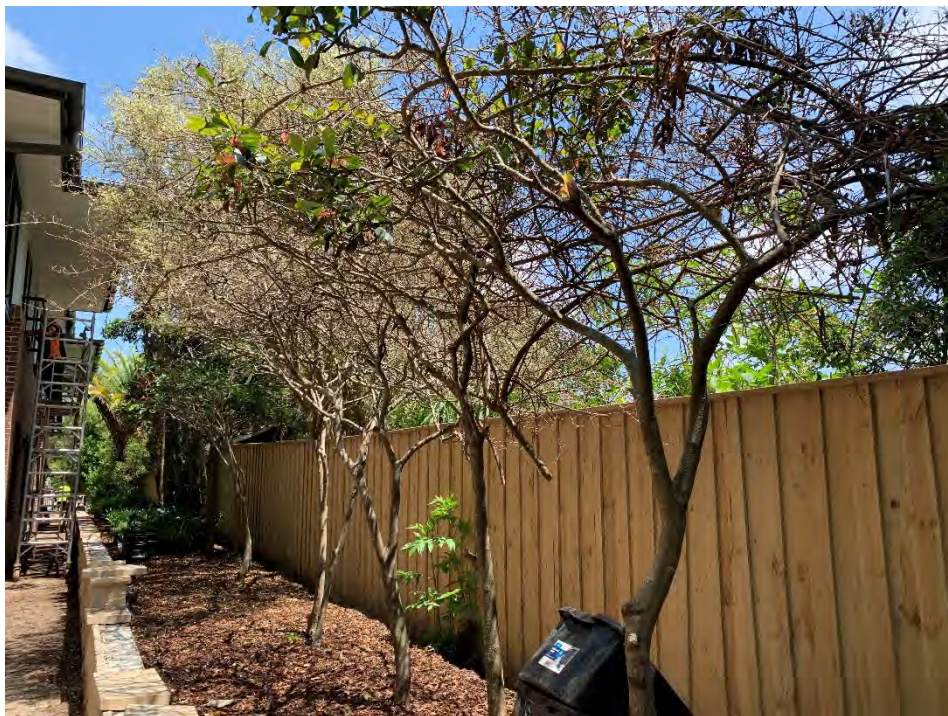
Figure 2 - Five of the dead trees within the hedgerow Tree No. 102.1 of January 2023